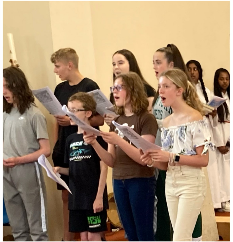
Some of the photos submitted of the Youth Mass last Saturday. Choristers, Servers and Readers all took an active part in the Mass. Afterwards Pizza! The theme of the mass was Refugees and understanding their plight.