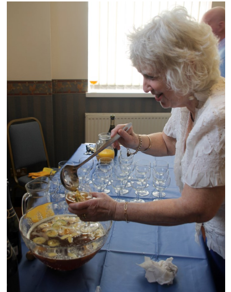
Last Sunday we had our own parish Coronation Celebration in the Becket Suite in the form of Afternoon Tea and cakes