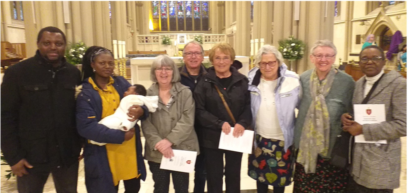
Just before Easter a group of St Cuthbert Parishioners went to Salford Cathedral to attend the Chrism Service